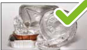
Foil and foil trays