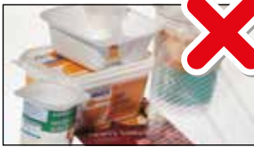
Plastic tubs, trays and yoghurt pots