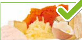
Dairy products including eggs and shells