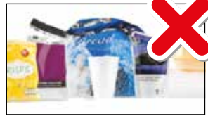
Crisp packets and pet food pouches