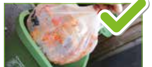
Place tied compostable liners in your green bin