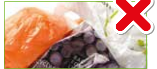
No plastic bags. Only use compostable liners