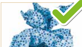
Paper gift wrap