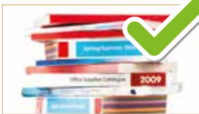
Telephone directories and catalogues