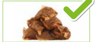
Tea bags, tea leaves and coffee grounds