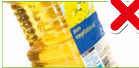
Oil or liquid fat