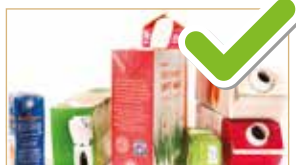
Drink cartons (e.g. fruit juice and long life milk)