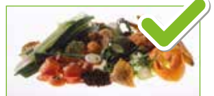
Fruit, salad, vegetables and peelings cooked or raw