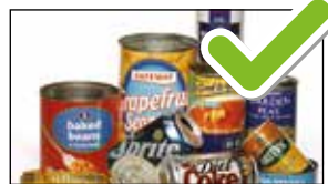
Food and drink cans

Don't forget to remove any lids, rinse/wash bottles, jars and cans then place them in your black bin.